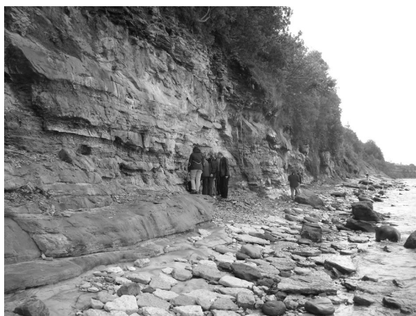
Fig. 2. Participants in the meeting in the Uuga outcrop, Pakri Peninsula, examining the Cambrian/Ordovician boundary beds.

(Fig. 2), where, respectively, Middle Ordovician and Cambrian–Ordovician sequences were studied. The quartz silt/sandstones, glauconite beds, lime- and dolostones, phosphorite beds as well as black- and oil shale beds were demonstrated and sampled.