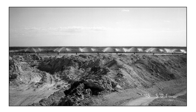
Fig. 5. The excess water evaporation system (sprinkling devices) in the 2nd ash field of the BPP

It is worth mentioning that before founding evaporation ponds, the area of the 2nd ash field had partially covered itself with different flora, mostly with birch brush. It confirms once more that the ash fields, which have not