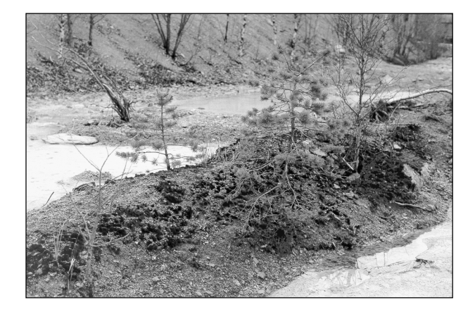
Fig. 1. The slope of the ash field of the Baltic Power Plant (BPP), October 31, 2001

Though the water used in the ash-handling system circulates, and in normal circumstances does not get out of the system, there is always a possibility that in the case of system leak large amounts of leaking high-alkaline water may bring about tremendous environmental pollution.