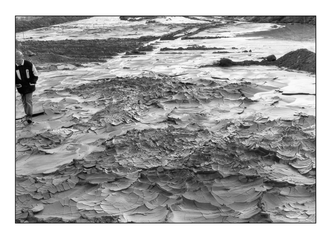
Fig. 4. The surface of the test ash field of the BPP, Oct 19, 2000

In addition, this technology would help to reduce the amount of water needed for ash handling as the planned ash and water ratio in the slurry is 1 : 1, compared to the amount of water 10–20 cubic metres per ton of ash in the present hydro-ash-removal system. As the suggestion seemed enticing, a contract was concluded to install a test facility to prepare dense slurry, and to set up a small test ash field (Fig. 4) and test cartridge in the 1st ash field of the BPP in order to carry out additional research work.