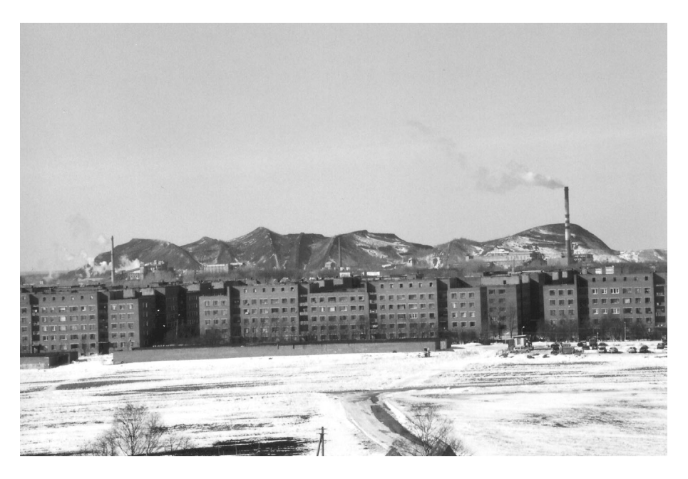
Fig. 3. Kohtla-Järve semi-coke mountains, known as North-East Estonian Central Ridge. The highest summit is the third from left (relative height 122 m)

There is a datum mark of 126 m above sea level at a knoll on the northern slope of old mountain of Kiviõli. The top of the knoll raises 79 m above the surrounding terrain and lies about 20 m lower from the top of the mountain itself. During the planning of a proposed ski centre on the old mountain in 2004, the relative height measured with GPS was 96 m. In summary, the relative heights of Kiviõli semi-coke mountains are 96 and 116 meters, respectively.