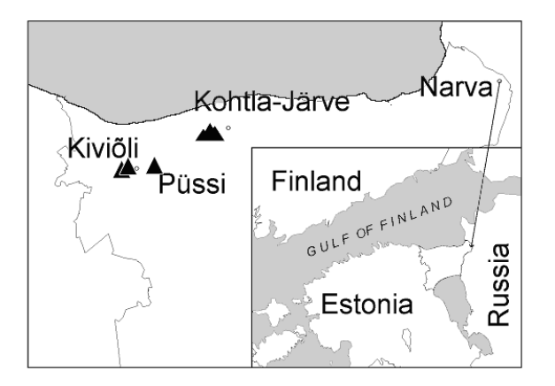
Fig. 1. Study area in Ida-Viru County

Most of the artificial landforms of oil shale industry lie in the northeastern Estonian Plateau (Fig. 1) [5]. Quaternary deposits, the thickness of which is mostly less than 2 m, cover the limestone bedrock in this landscape region. The absolute height of the generally flat plateau reaches 30–50 m above the sea level, making the artificial landforms of oil shale industry conspicuous landmarks in the surrounding. The western ones lie near the town of Kiviõli, while the eastern ones are situated south from the town of Narva. Such landforms with similar origin are also found near the town of Slantsõ in Russia. Industrial mining of oil shale in Estonia began in 1916, and the total output has reached at 850 million tonnes by today.