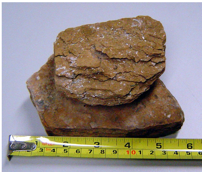
Fig. 3. Unprocessed oil shale pieces from the LOS-process waste dump