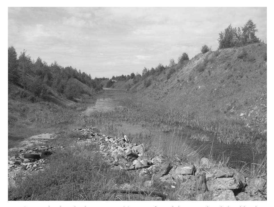
Fig. 3. Maardu phosphorite opencast 20 years after mining. Uranium is leaching into the water bodies.