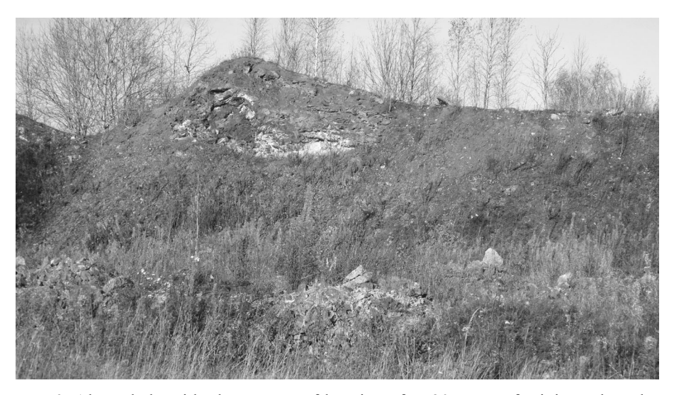
Fig. 2. Alum shale with clear traces of burning after 20 years of mining.

Spontaneous combustion can occur in heaps that are both a few months as well as over 20 years old (Fig. 2). Spontaneous heat generation and combustion is usually most intense in 3–5-year-old heaps. In 1990, at the