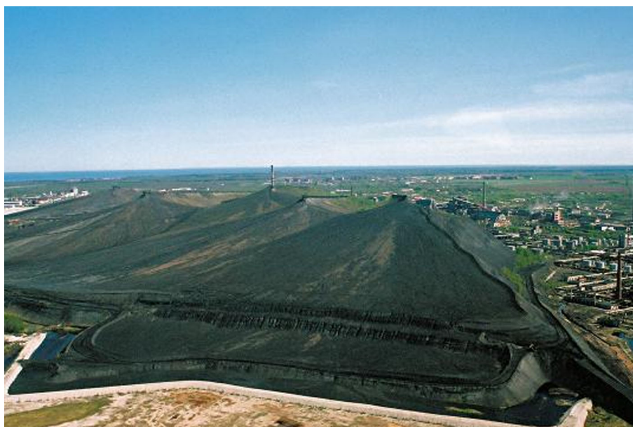
Fig. 1. Kohtla-Järve semi-coke hills containing 53,639,000 tons of hazardous waste on the territory of 0.93 sq km.

Oil shale semi-coke is classified in Estonian and European Union waste lists as hazardous waste since it contains toxic tarry and bituminous substances. Its chemical composition strongly resembles that of raw oil shale. Semi-coke contains high amounts (mg/kg) of Ca (about 250,000), Mg (9800–12,000), Fe (25,000–27,000), Al (12,000–16,000), K (7300–8800)