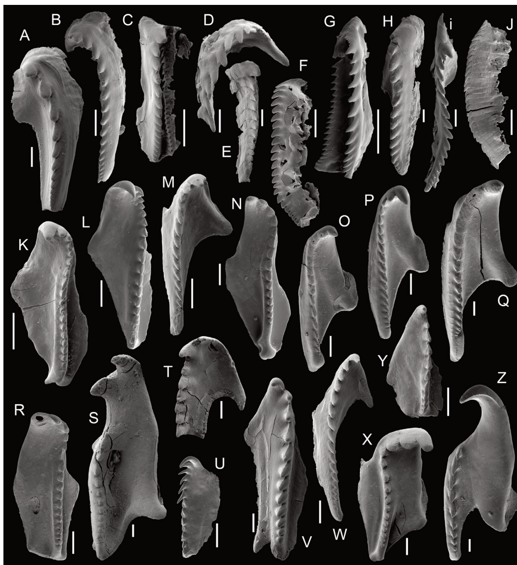
Fig. 2. Selected latest Katian and Hirnantian scolecodonts from the Reinu quarry, northern Estonia. All scale bars correspond to 100 \mu\text{m} . E, Y – from sample OM22-36 (Adila Formation, Katian); G – from sample OM22-34 (Adila Formation, Katian); H, S, T – from sample JN22-1 (Katian/Hirnantian); Q – from sample OM20-113 (Siuge Member, Hirnantian); R, X, Z – from sample OM20-112 (Siuge Member, Hirnantian); all others are from sample OM20-103 (Siuge Member, Hirnantian). A – Pistoprion transitans , left MI, GIT 888-1; B – Vistulella kozlowskii , left MI, GIT 888-2; C – Vistulella kozlowskii , right MI, GIT 888-3; D – Xanioprion cf. borealis , anterior part of MI, GIT 888-4; E – Xanioprion cf. borealis , posterior part of MI, GIT 888-5; F – Xanioprion sp., MI, GIT 888-6; G – Mochtyellidae gen. nov., left MI, GIT 888-7; H – Mochtyellidae gen. nov., left MI, GIT 888-8; i – Mochtyella aff. duplicidentata , right MI, GIT 888-9; J – Lunoprionella? sp., posterior jaw, GIT 888-10; K – Oeononites aff. jennyensis , left MI, GIT 888-11; L – Oeononites aff. wyszogrodensis , left MI, GIT 888-12; M – Oeononites aff. wyszogrodensis , right MI, GIT 888-13; N – Oeononites marlenediesae , left MI, GIT 888-14; O – Oeononites marlenediesae , right MI, GIT 888-15; P – Oeononites aff. eichwaldi , right MI, GIT 888-16; Q – Oeononites zappae , right MI, GIT 888-17; R – Protarabellites rectangularis , left MI, GIT 888-18; S – Protarabellites aff. triangularis , right MI, GIT 888-19; T – Kettnerites sp., right MI, GIT 888-20; U – Pteropelta aff. gladiata , basal plate, GIT 888-21; V – Pteropelta aff. gladiata , left MI, GIT 888-22; W – Pteropelta aff. gladiata , right MI, GIT 888-23; X – Symmetrion spatiozus , right MI, GIT 888-24; Y – Kalloprion sp., left MI, GIT 888-25; Z – Atraktoprion cf. major , right MI, GIT 888-26.

Additionally, sporadic specimens of Symmetrion spatiozus (Fig. 2X) and Tetraprion pozaryskae , as well as a few other taxa, have been recovered in the Siuge Mb.